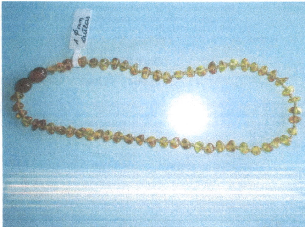
Amber baby's necklaces with push clasps (light shade of cognac, baroque beads)